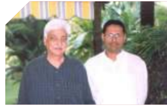
Mr. AZIM H PREMJI