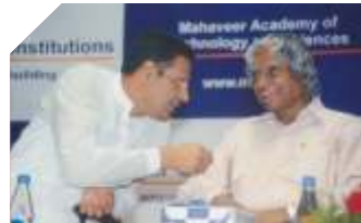
Dr. A P J ABDUL KALAM