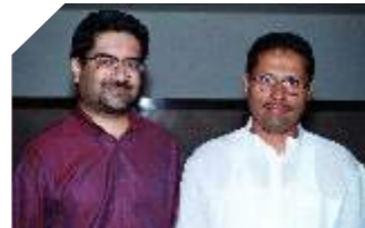
Dr. KUMAR MANGALAM BIRLA