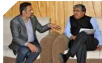
Mr. NANDAN NILEKANI