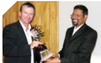
Mr. STEVE WAUGH