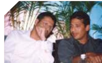
Mr. MAHESH BHUPATHI