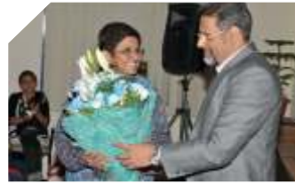
Dr. KIRAN BEDI