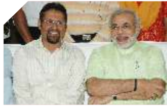
Mr. NARENDRA DAMODARDAS MODI